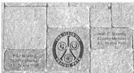
The two Mooring bricks flank The IPPc logo at the Illinois Prairie Path section of the park

When you visit, be sure to notice the IPP and member bricks at the east end of the park. The two Rotary Clubs of Wheaton are still accepting orders for engraved bricks at the park. More information on the brick program is available at http://www.wheatonrotary.org/brickform.htm or by calling 630-871-2857. Please note your preference to be included in the special area designated for members and friends of the Illinois Prairie Path when placing an order.