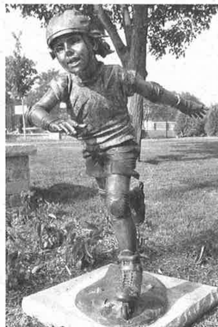
Sculptures adorn the park