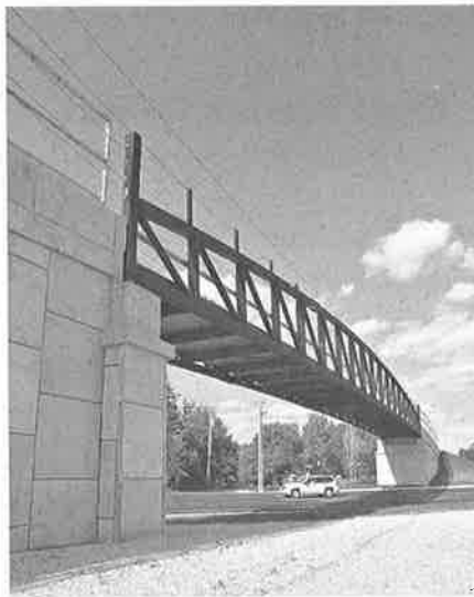
Path users can now enjoy the convenience and views from the Ferry Road bridge

Prince Crossing; and Don Kirchenberg, Great Western Trail.